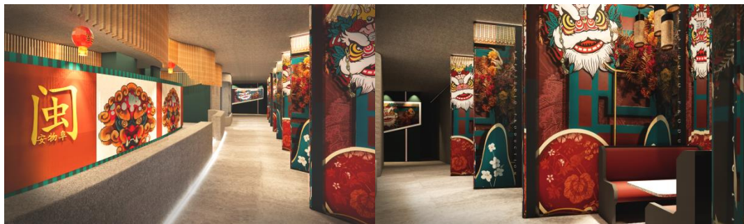
Figure 5 Effect Picture of the Free seating Area of the Restaurant (Source: self-made by the author).

On the right side of the free seating area, the pattern of "Wind Lion God" is used as the partition wall to separate the dining seats, so as to ensure relative privacy and take pictures as the background (as shown in "Figures 5"). The partition walls are in a certain order, enriching the space level, enhancing the aesthetic sense of form, and echoing with the left cash register to set off the space atmosphere. The whole space has a distinctive theme image from any angle, and the traditional color matching of red and green also adds a sense of festivity and traditional style.