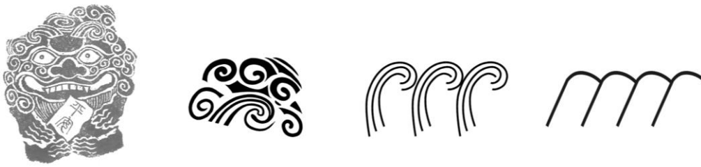
Figure 1 Pattern reconstruction of the Wind Lion God.