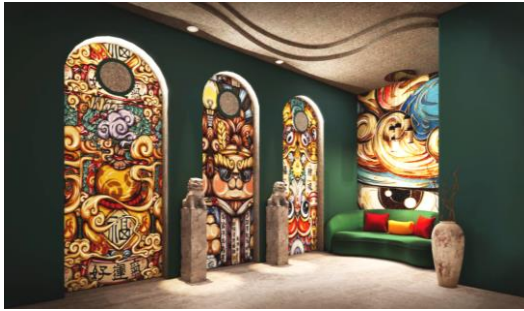
Figure 3 Rendering of the waiting area in the restaurant (source: self-made by the author).