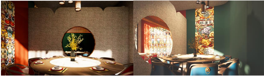
Figure 6 Design sketch of private room of the restaurant.

The overall wall design is simple and modern, which conforms to the aesthetics of contemporary young people, and also offsets the "messy" sense brought by color, and makes the space rich and simple.