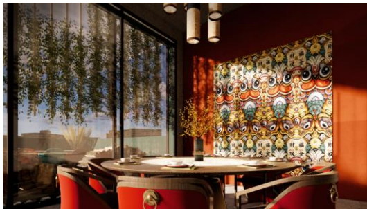
Figure 7 Rendering of private room of the restaurant.

As one of the themed private rooms, the wall near the outside is set with glass, and small scenes such as green plants are placed outside the glass to make the private room transparent, ornamental and private (as shown in "Figure 7").