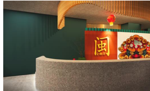
Figure 4 Rendering of the cashier area of the restaurant.

What opposite to the entrance is the cash register and open kitchen of the restaurant (as shown in "Figure 4"). Here, the restaurant's signboard is magnified to highlight the main cuisine of the restaurant, and "Min", and "An", "Wu" and "Fu" are included in Fujian, reflecting a sense of dependence and home and intending to give customers a sense of intimacy and belonging at home. The colors are red, yellow and green, which are the main colors of Wind Lion God, representing a good moral. At the same time, it is required to adjust the color area, so that the color is contrast and eye-catching, but not too strong for discomfort. The semi-open kitchen can be viewed by diners, increasing the ceremony and interest of dining, and forming an interactive relationship between the restaurant and consumers.