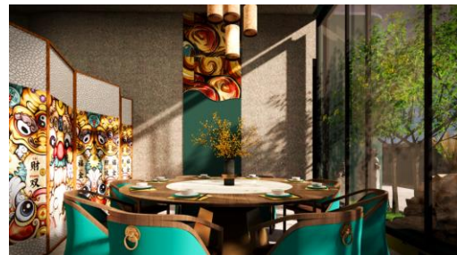
Figure 8 Effect picture of the private room of the restaurant (Source: Self-made by the author).

One of the private rooms (as shown in "Figure 8") is connected to the other side and separated by a screen. The common design method in the space is to integrate the art works with style and characteristics. On the screen, the decorative paintings of Wind Lion God with vivid images and bright colors are selected to set off the space theme. Borrowing the scenery and sunshine outside the window, people can enjoy the natural light and a variety of space atmosphere will be created.