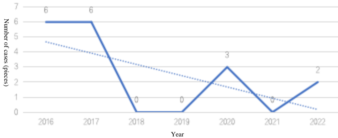
Figure 1 Statistics of the number of cases of forest resources destruction accepted by the People's Court of D County.

felling of trees. The specific year distribution is as follows: ("Figure 1")