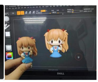
Figure 3 Students' classroom digital sculpture model and 3D printing physical results.