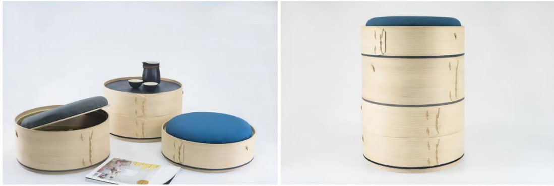
Figure 4 Reunion stool.