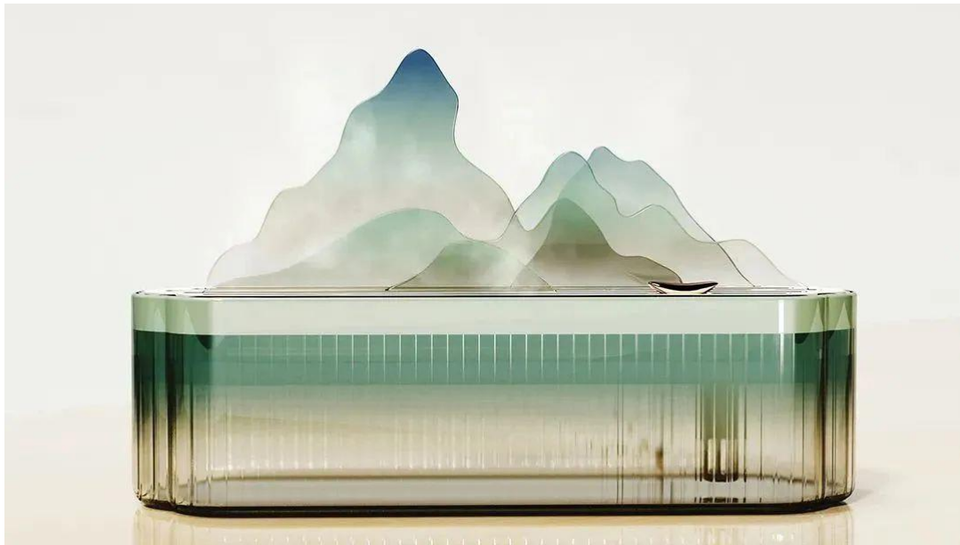
Figure 2 Only This Green — aromatherapy humidifier.

aesthetics of the Song Dynasty. This product integrates functionality, aesthetics, and culture, which perfectly fits the design concept of "being gentle and elegant".