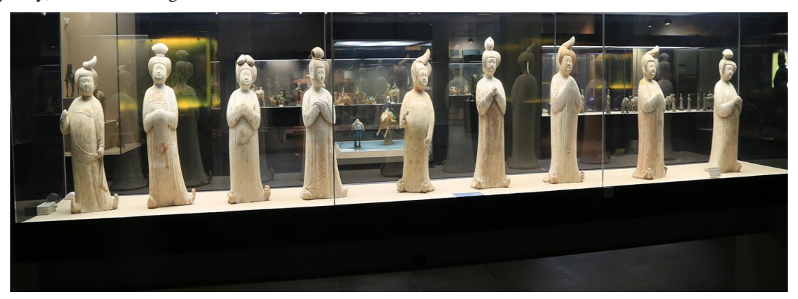
Figure 3 Lady painted pottery in museum.

Painted figurines were used in ancient burial ceremonies in China, dating back to the Shang Dynasty, as shown in "Figure 3".