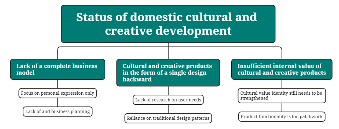
Figure 2 Status of domestic cultural and creative development.

consumer's identity is the core of the marketing of the cultural creation product, but the majority of the products in the market only focus on the color and appearance of the visual impact, and do not coordinate with the cultural and aesthetic value. Therefore, the persuasive power of cultural creation products is not sufficient, and it is hard to bring out the appeal and market potential of cultural creation products. As a result, the persuasive power and expressiveness of cultural and creative products are not sufficient, and it is hard to fully exploit their appeal and market potential that do not correspond to the cultural value of the cultural and creative goods themselves. ("Figure 2")