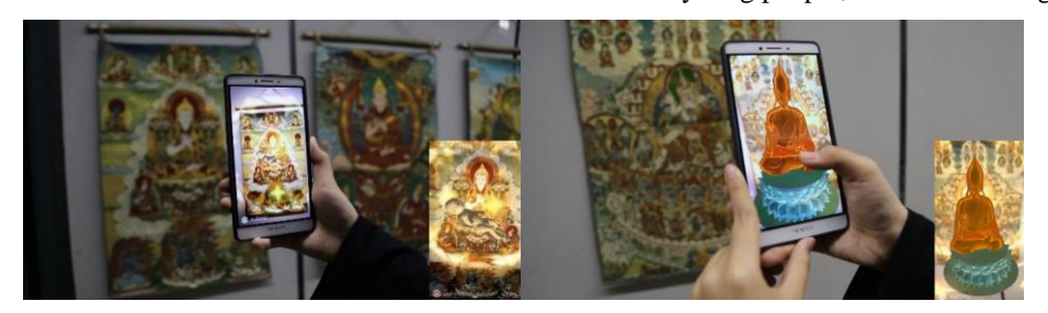
Figure 4 AR Interactive Cultural and Creative products.

According to the new wave of market demand, break the original material carrier, and constantly develop new possibilities in the form of artistic expression, such as AR expression of cultural and creative design, so as to cater to the diversified needs of young people, as shown in "Figure 4".