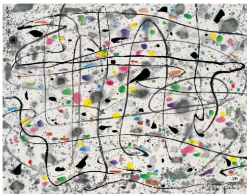
Figure 1 Shi Tiesheng's "Me and the Temple of Earth" by Wu Guanzhong, illustrated by Hunan Literature and Art Publishing House/2016-10.

reveals that the correspondence between images and texts is sometimes not consistent, especially in literary illustrations and even in some serious science popularization illustrations. The success or failure of narrative often does not depend on whether its realistic techniques are superb, but on whether the ideas it carries out are clever, whether the content it expresses can be accepted by people, and whether it is rich. In other words, a complete narrative is not the fundamental purpose of realistic painting, but only one of the reasons for receiving applause.[3] Just like narrative is to painting, illustrators seem never satisfied with the literal translation of the text in the "A to A" style. Illustrated works often contain the artist's subjective understanding of the text and the involuntary integration of personal artistic style. The artists' performance in image creation after interpreting texts is particularly evident in the field of literary illustration. Wu Guanzhong clearly integrated his unique style of painting language into the illustration creation of Shi Tiesheng's lyrical prose "Me and the Altar of Earth" ("Figure 1").