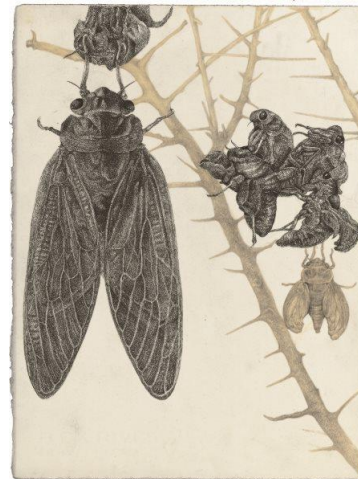
Figure 3 Illustration exhibition of the 12th National Art Exhibition of Fabre, the original work of Xiao Yong's "Insect Chronicle".