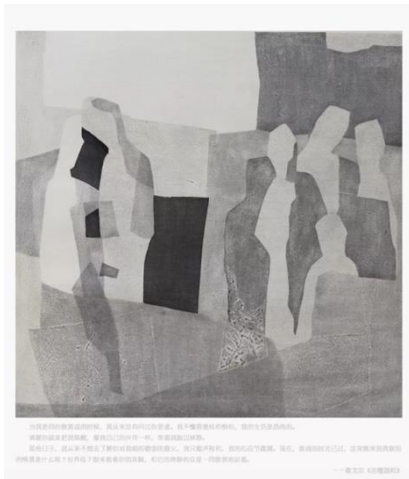
Figure 2 Tagore, the original work of Wu Su's "Jitanjali".

impulse for artistic creation is the nature (talent) of most artists, and their artistic impulse brings a broader space for illustration creation, which seems to be "breaking away from textual narrative". Literary illustrations have always been a profound inspiration for the development of images towards the direction of painting creation, and have also inspired many artists to showcase their artistic talents while achieving "text correspondence". Even in the serious creation of popular science illustrations, artists consciously showcase their exquisite creativity. ("Figure 2") Xiao Yong from Guangzhou Academy of Fine Arts showcased wonderful visual effects in his illustration of Fabre's "Insect Chronicles" ("Figure 3"). From the images, not only are the biological forms of insects visible, but readers can also enjoy a pleasant aesthetic experience in the appreciation activities. Of course, Fabre's "Insect Chronicles", as a creative template, has a strong literary quality. French writer Hugo or Chinese writers Lu Xun(鲁迅) [5], Zhou Zuoren(周作人), and Ba Jin have praised his works generously. Taking the illustration exhibition of the National Art Exhibition as the research object, it can be found that the situation of breaking away from textual narrative gradually expands with the opening and diversification of cultural concepts. ("Figure 4")