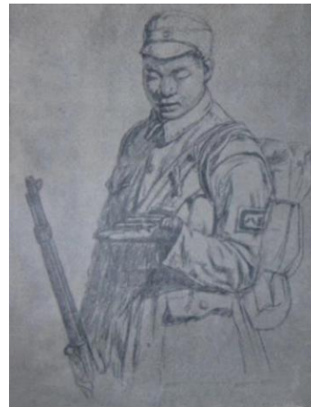
Figure 4 Tian Jintai's "Three Bullets" at the 2nd National Art Exhibition by Xin Mang.