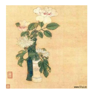
Figure 5 "Flower Album - No. 7" Ming Dynasty Chen Hongshou Silk, colored, eight sections opened.

In "Ice Pot Autumn Colors" ("Figure 6"), there are two vases, one deep and one light, one large and one small. The large glass vase, with its transparent texture, subtly reveals the branches within, while a section of blue cloth adorns the vase body, preventing it from appearing too light and adding an air of dignity and elegance. Inside the large vase, a tall branch and two autumn flowers are arranged; the autumn leaves on the branch are bright red, with glistening dewdrops, and the autumn grass resembles cockscomb, with drooping leaves and some withered spots. In terms of floral materials, they are far from perfect, yet it is this imperfection that gives them a mottled beauty. The highlight within the vase is two white wild chrysanthemum flowers, one tall and one short, both clusters blooming lively, showing an extremely gorgeous contrast in both color and texture. Beside it, the small vase contains a cluster of the same wild chrysanthemums, echoing the height of those in the large vase, and two white roses, one open and one partially hidden, add a touch of vitality. In Chen Hongshou's vase offerings, "Ice Pot Autumn Colors" displays an idyllic countryside scene, conveying a sense of retreat and seclusion through the pure offerings.