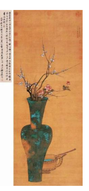
Figure 7 "Qinggong Tu" Ming Dynasty Chen Hongshou Silk, colored, dimensions unknown, private collection.