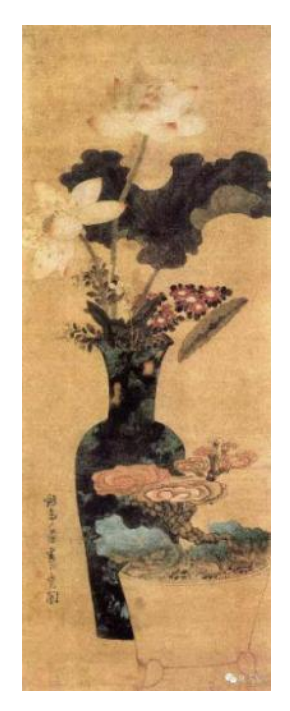
Figure 8 "Peace rui" Ming Chen Hongshou silk book color 133*50.7cm Cheng Shifa old collection.

In Chen Hongshou's vase offerings, he is solely concerned with expressing his own world, where rusted vases seem to perpetually bloom with elegant flowers such as plum blossoms, chrysanthemums, and lotuses, which are extraordinary and reflective of his innermost feelings, filled with the painter's boundless affection and anticipation. Chen Hongshou's