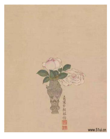
Figure 3 "Flower and Bird Album VI - Copper Vase Rose" Ming Dynasty Chen Hongshou Silk, colored, ten sections opened.

persistent depiction of his favorite subjects, treating his works like a refined Qinggong object to be savored repeatedly. On the other hand, with the commercialization of paintings, it is possible that these vase-themed works became orders that the artist reproduced multiple times. However, these aspects are no longer important. What matters is that Chen Hongshou has left us with numerous elegant and ancient vase-themed works, firmly imprinting this significant Qinggong theme in the history of flower-and-bird paintings.