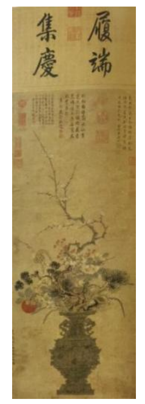
Figure 9 "New Year's Picture" Scroll (Attributed to) Ming Dynasty Bian Wenjin Paper, colored 108× 46.1cm.

and scholarly objects of contemplation in flowerand-bird paintings. Works such as Sun Kehong's "Cloud Window Qingwan Tu" ("Figure 12") and "Painted Orchid Pot," Lan Ying's "Strange Stone Tu" and "Lake Stone Tu," and Xiang Shengmu's "Qin Spring Tu" are examples of this genre. Further elaboration is not necessary here.