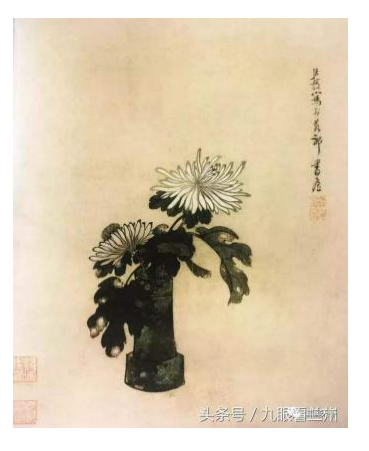
Figure 4 "Flower and Bird Album VIII - Copper Vase White Chrysanthemum" Ming Dynasty Chen Hongshou Silk, colored, ten sections opened.