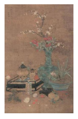
Figure 10 "New Year's Qinggong Picture" Ming Dynasty Zhou Zhimian Paper, colored 89× 56cm Private collection.

Figure 9 "New Year's Picture" Scroll (Attributed to) Ming Dynasty Bian Wenjin Paper, colored 108× 46.1cm.