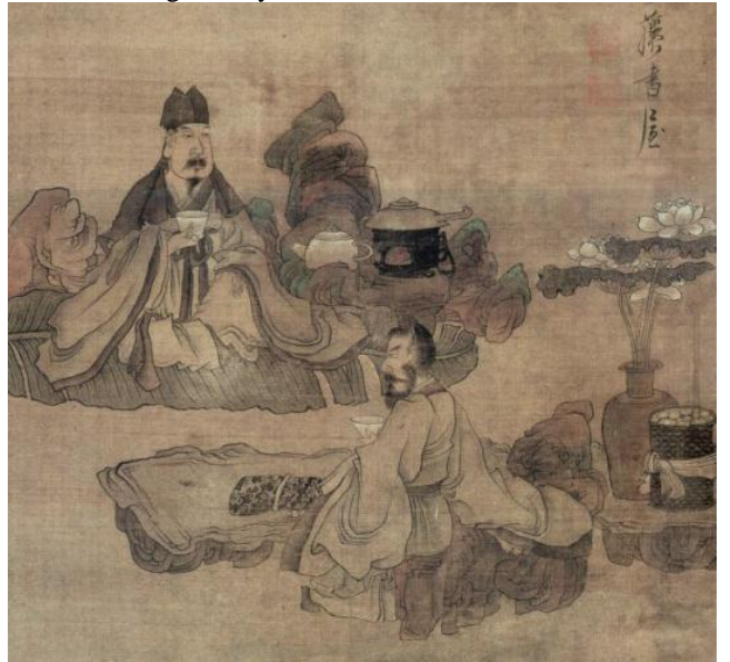
Figure 1 "Tea Tasting Scroll", Vertical Scroll Ming Dynasty Chen Hongshou Silk Thread Color, 75*53cm.

In Chen Hongshou's "Tea Tasting Scroll" ("Figure 1"), two people sit facing each other with raised cups, with an ancient musical instrument on the stone table in the middle, accompanied by tea snacks. The most prominent feature is a white lotus blooming in a vase on the right. Whether leaning against the stone or sitting on a banana leaf, the two people engaged in tea tasting and conversation appear simple and innocent, with a natural charm. Chen Hongshou skillfully uses Qinggong to convey a reclusive demeanor.