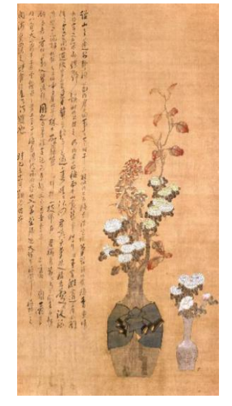
Figure 6 "Ice Pot Autumn Colors" Ming Dynasty Chen Hongshou Silk, colored, dimensions unknown, collection of the British Museum, UK.

mushroom), and artificial rocks, with the explicit meaning of "peace presenting auspiciousness." At the forefront of the composition is a low, earthenware pot containing a small artificial rock and the Ganoderma lucidum, symbolizing good fortune. Behind this, a tall, antique copper vase stands, with two elegant lotus flowers gracefully arranged within, complemented by a large lotus leaf. A cluster of assorted aquatic and terrestrial flowers embraces the vase's opening, creating a rich and full scene that exudes elegance and auspiciousness. Such a vase arrangement, whether used for New Year celebrations or to adorn a study, demonstrates the owner's refined taste and sophistication.