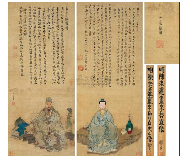
Figure 2 "Portrait of Lai Luzhi", Vertical Scroll Ming Dynasty Chen Hongshou Silk Thread Color, 102.5× 45.5cm. (Left). "Portrait of Lady Lai Luzhi" Vertical Scroll Ming Dynasty Chen Hongshou Silk Thread Color, 102.5×45.5cm. (Right)

the era in which she lived, a state of life where ancient objects are closely integrated with daily life, and also reflects the distinct secular characteristics shown in Chen Hongshou's paintings, making the figures under his brush full of warmth.